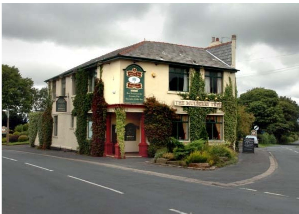
Mulberry Tree, Wood Lane, Wrightington

Published on Wednesday 22 June 2011 09:00